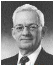
PAUL H. O'NEILL