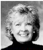
MARTHA LAYNE COLLINS