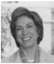
LAURA D'ANDREA TYSON