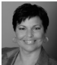
DEBRA L. LEE